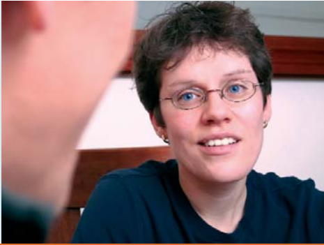
Posed by models